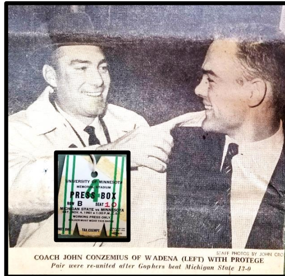
University of Minnesota Gopher