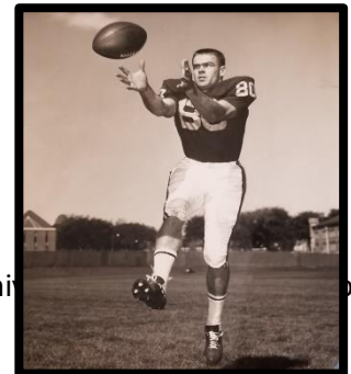
University of Minnesota Gopher